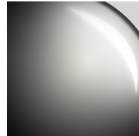
Steel - STE