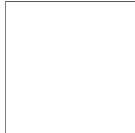
White - WHI